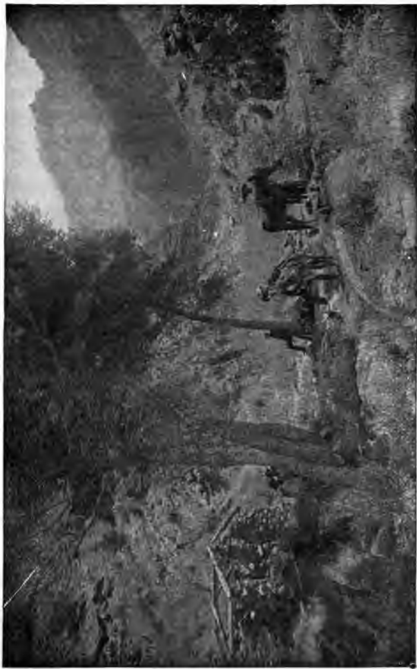
“Heart of the West”